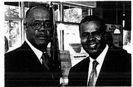
District Attorney Paul L. Howard, Jr. and Atlanta Mayor Kasim Reed