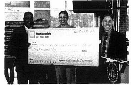
The BTF accepts a check from Nationwide